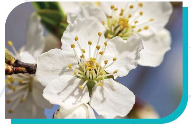
BACH FLOWER REMEDIES