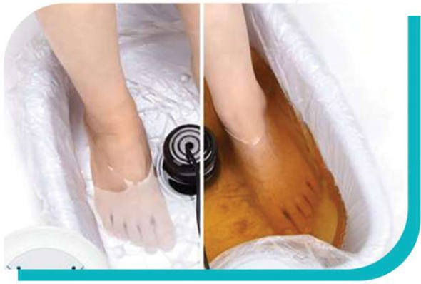
IONIC DETOXIFICATION THERAPY