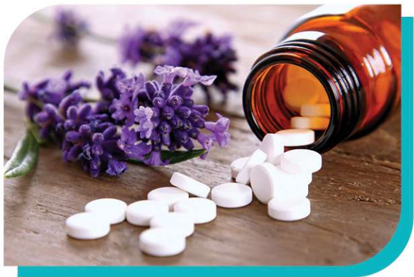
BIO SALT REMEDIES